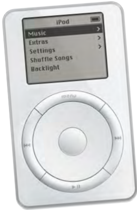
iPOD & iTUNES