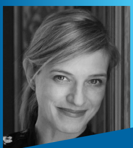
PATI JINICH Chef and Host of Pati’s Mexican Table on PBS // @PatiJinich

Sister Norma Pimentel earned her Bachelor’s degree in Fine Arts from Pan American University, a Master’s degree in Theology from St. Mary’s University in San Antonio, Texas, and a Master’s degree in Counseling Psychology from Loyola University in Chicago, Illinois.